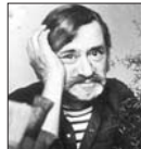
Ezra Jack Keats

TV Broadcast Premiere of Weston Woods productions on CBS's Captain Kangaroo